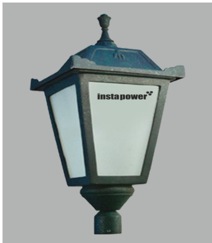
Polar curve can be provided on request

Galaxy is a post top lamp and is ideal for outdoor lighting. It has a victoria era look and finish; an old world charm.