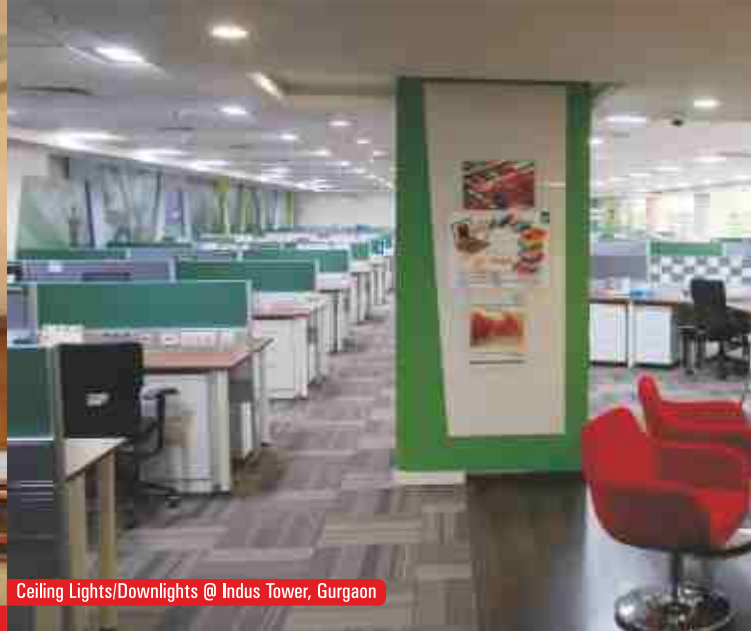
Ceiling Lights/Downlights @ Indus Tower, Gurgaon