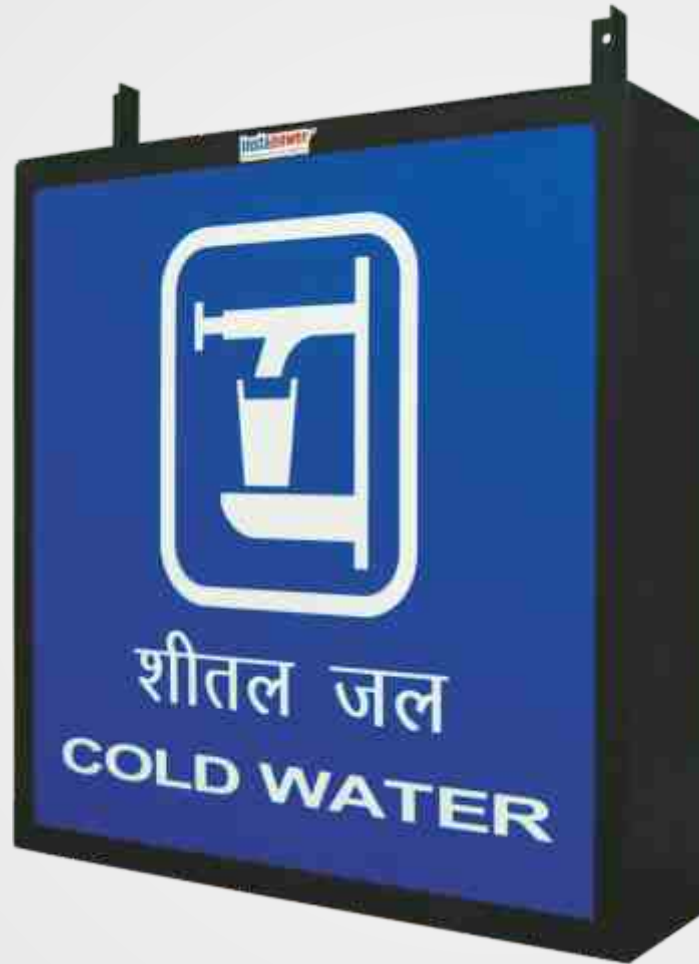
Fixture Colour - Black