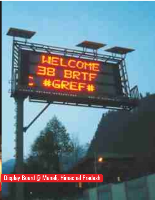
Display Board @ Manali, Himachal Pradesh