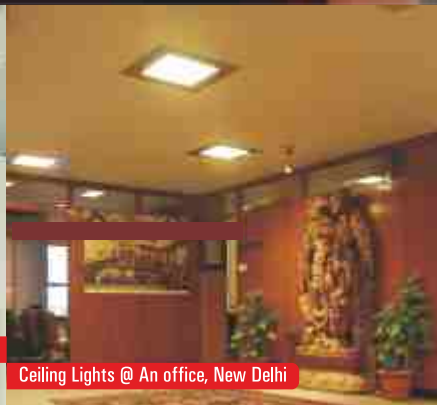
Ceiling Lights @ An office, New Delhi