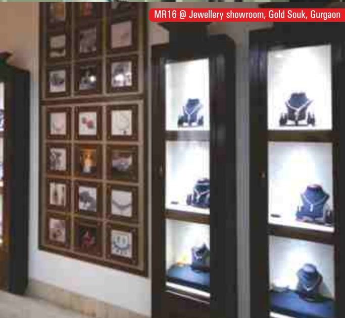
MR16 @ Jewellery showroom, Gold Souk, Gurgaon