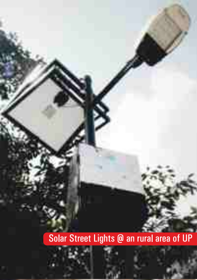
Solar Street Lights @ an rural area of UP