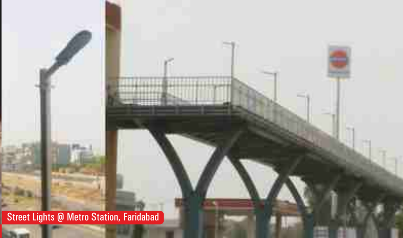
Street Lights @ Metro Station, Faridabad