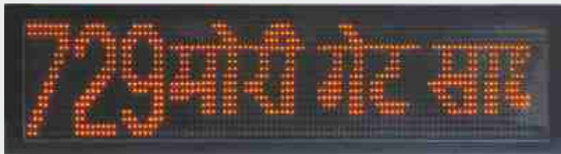
Side and Rear