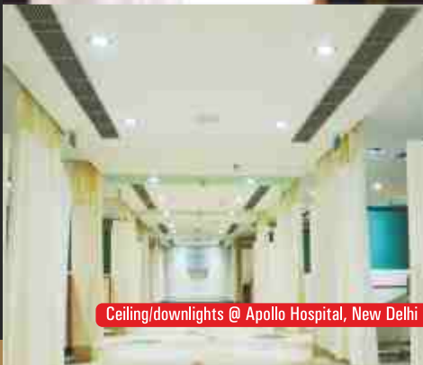
Ceiling/downlights @ Apollo Hospital, New Delhi