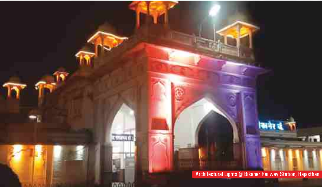
Architectural Lights @ Bikaner Railway Station, Rajasthan