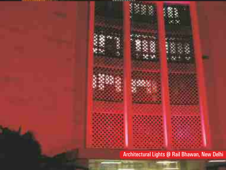
Architectural Lights @ Rail Bhawan, New Delhi