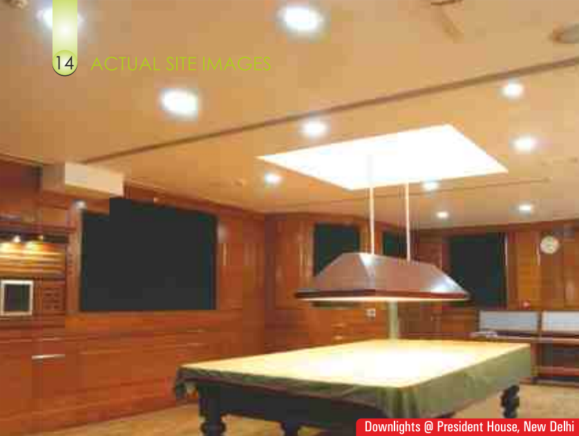
Downlights @ President House, New Delhi