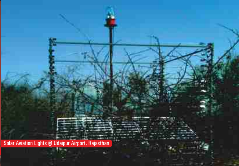
Solar Aviation Lights @ Udaipur Airport, Rajasthan