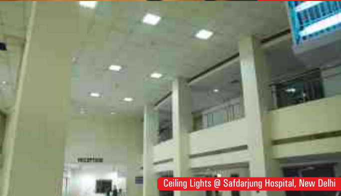
Ceiling Lights @ Safdarjung Hospital, New Delhi