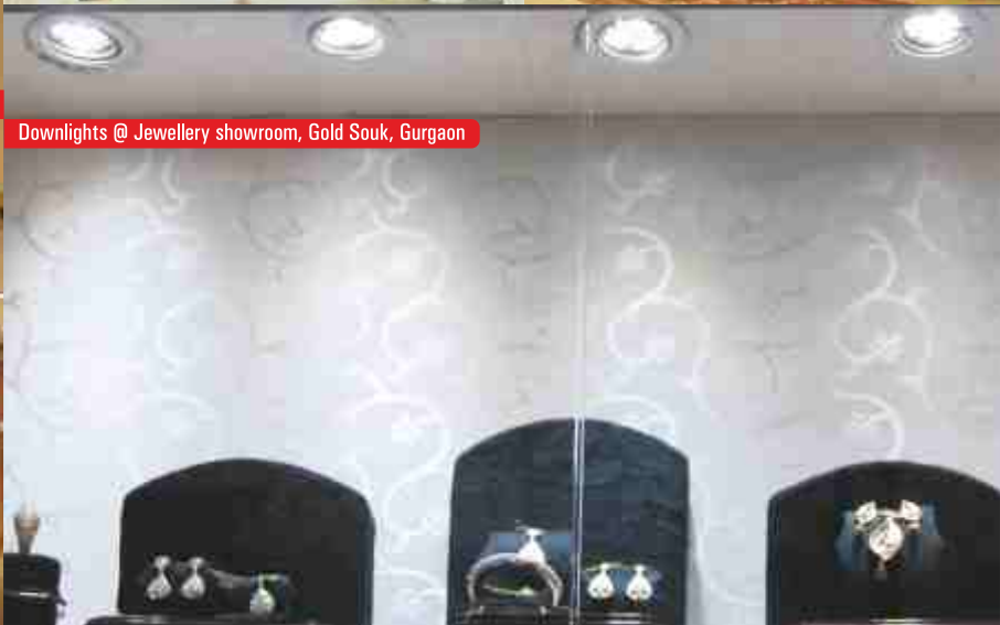
Downlights @ Jewellery showroom, Gold Souk, Gurgaon