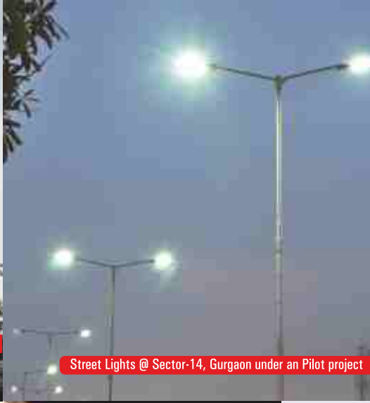
Street Lights @ Sector-14, Gurgaon under an Pilot project