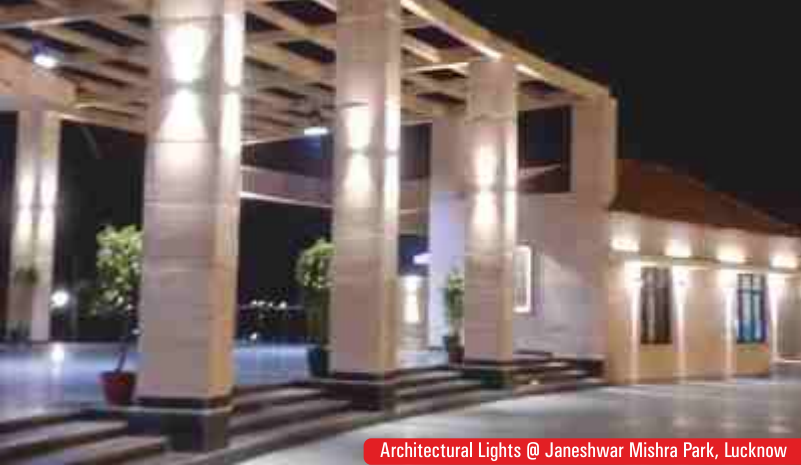
Architectural Lights @ Janeshwar Mishra Park, Lucknow