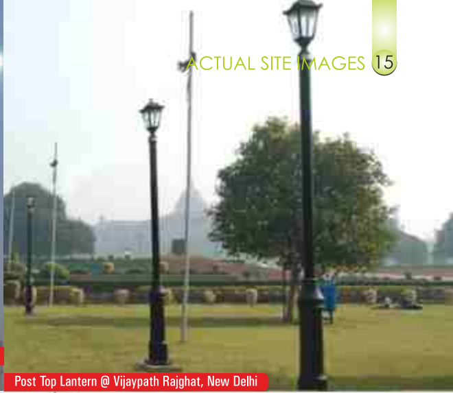
Post Top Lantern @ Vijaypath Rajghat, New Delhi