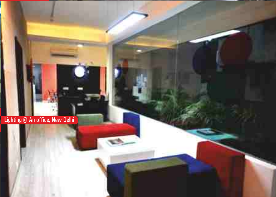
Lighting @ An office, New Delhi